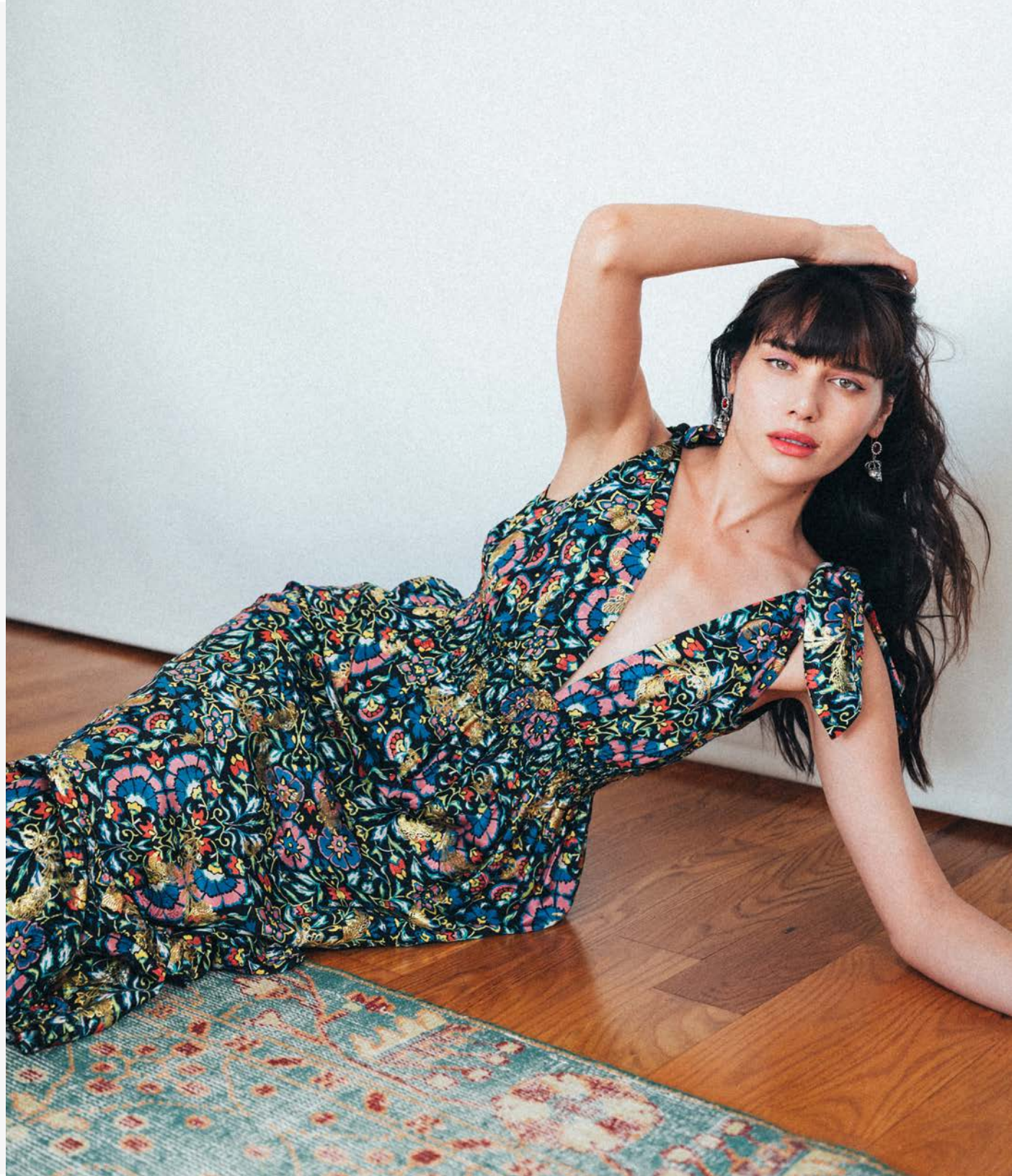
Mosaic Lurex Smocked Tie Shoulder Dress CE17990 $170 | $375