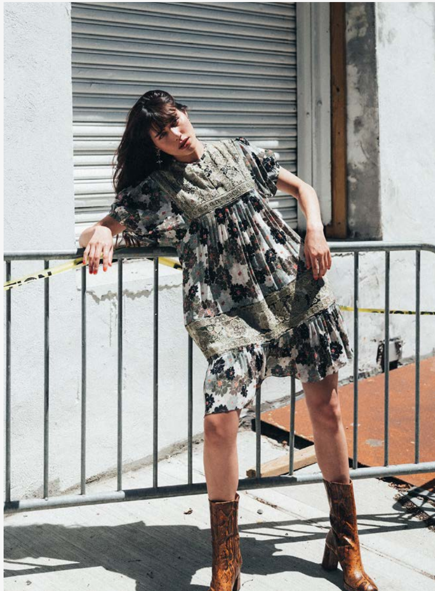
Camo Delilah Silk Embroidered Dress CD17956 $180 | $395