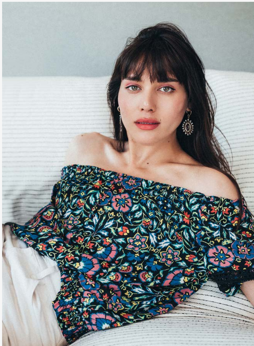
Mosaic Silk Off The Shoulder Smocked Top CT17984 $130 | $285