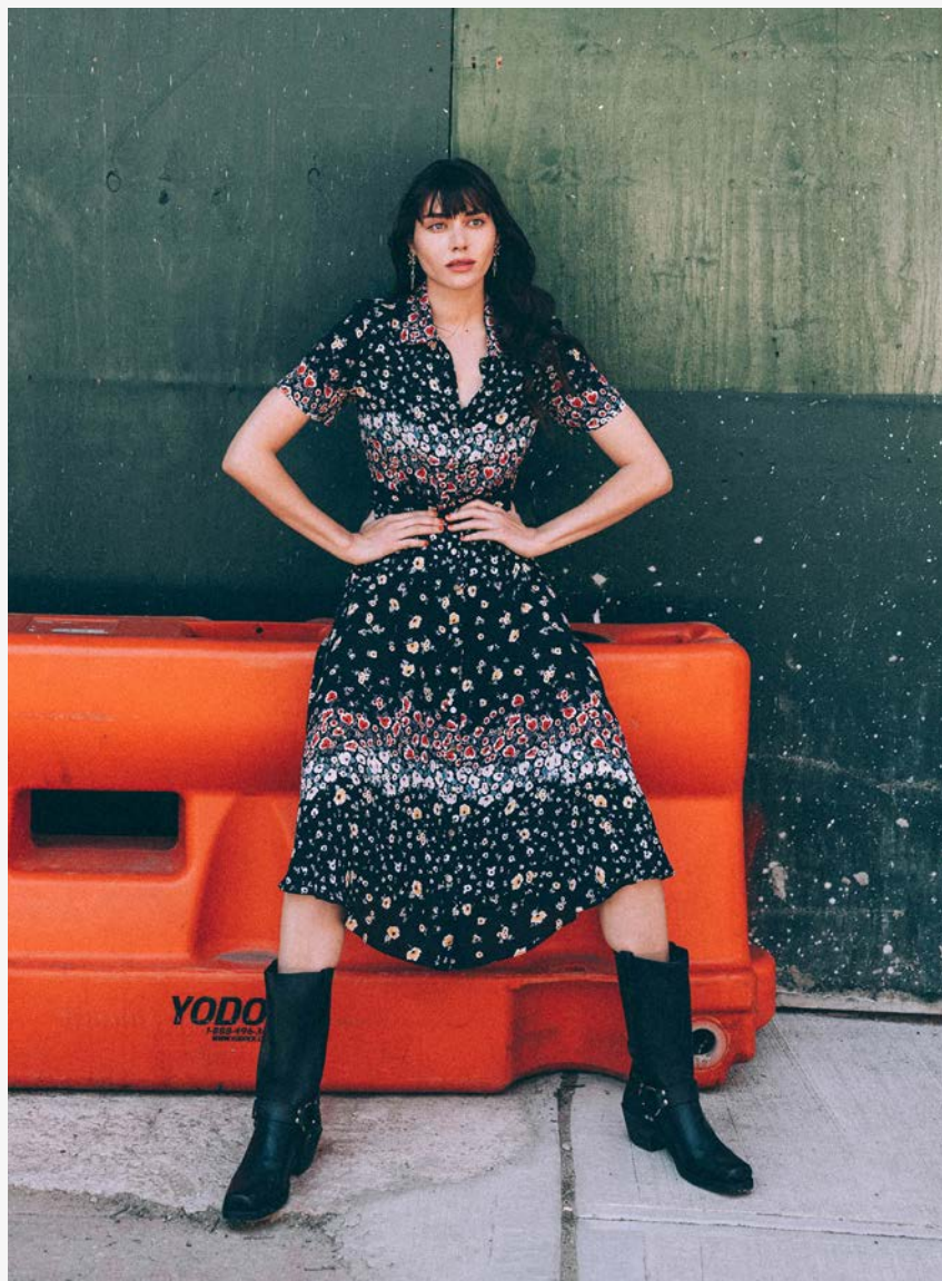
Ashbury Floral Silk Collared Shirt Dress CD18087 $165 | $365